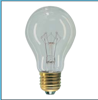
TRAF E27 A60 CL