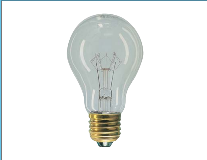
TRAF E27 A65