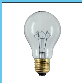
RC E27 A65 CL