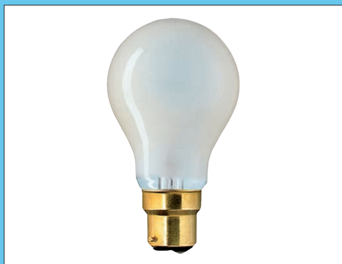
RC B22 A60 FR