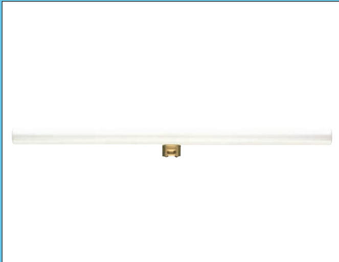
LINEAR S14d T30 WH