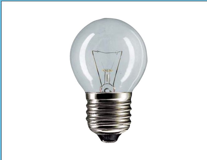
APP E27 P45 CL