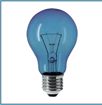
DAYBLUE E27 A60 D-B