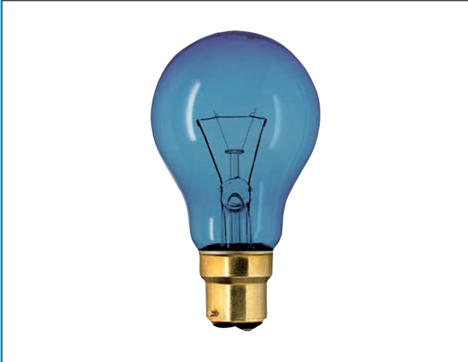
DAYBLUE B22 A60 D-B