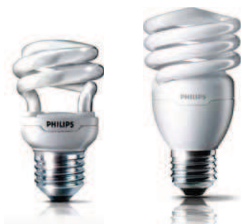
Tornado 5W/8W/12W E27